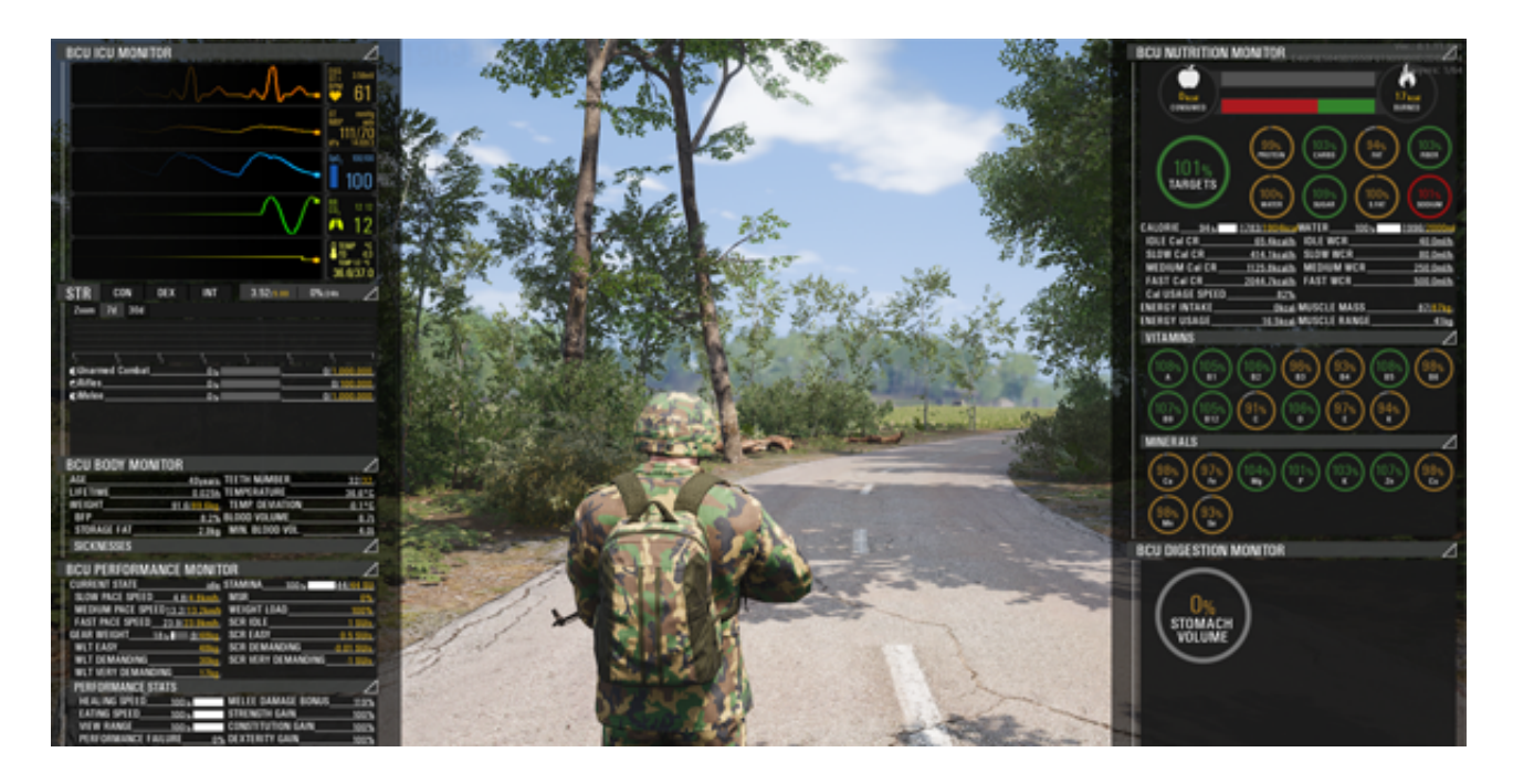
Massive Landscape: Traverse and explore 144 sq km of terrain that includes dense forests, picturesque beaches, serene fields, abandoned towns, and rundown airfields. Initially, the massive terrain will be handled by foot and as development continues vehicles will be introduced for quicker movement.