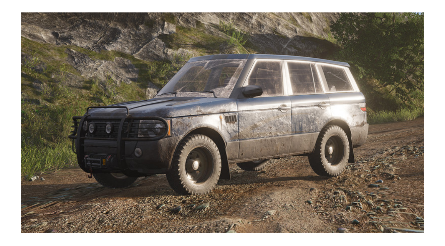
Download ->->-> http://bit.ly/2NF7B9b