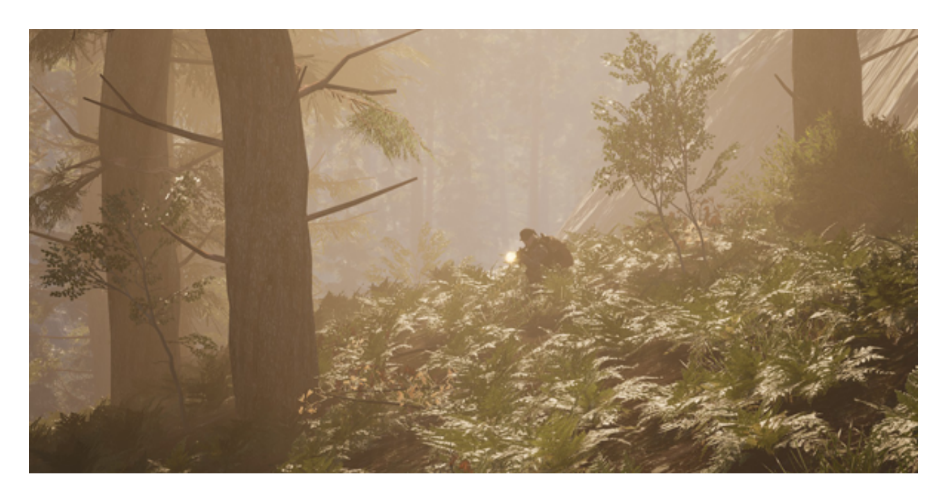
Expanding Gameplay: While the current version of SCUM already includes basic crafting, combat, and customization systems, the featureset and gameplay will continually expand to include more advanced mechanics, more variety in gameplay, and a metanarrative for players to complete missions with hopes of one day getting off the island...