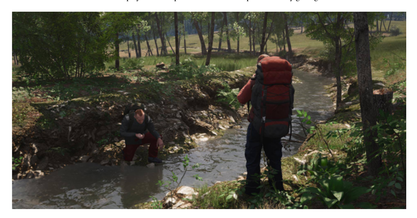
Online Multiplayer: Survive with up to 64 players per server with the option to rent your own server right from the in-game menu.