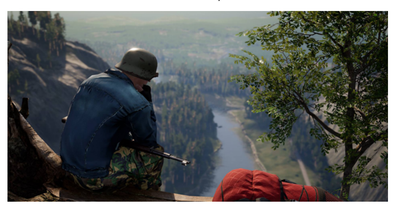
PvP Network Events: Enter TEC1's ongoing network events with a click of a button and be whisked to enclosed areas of the island for white-knuckle PvP gameplay. Volunteer for an event and be pitted against other prisoners with fame points and high value loot on the line for those that survive.